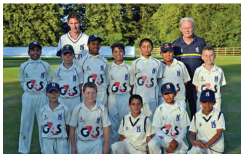
Under 11b Squad