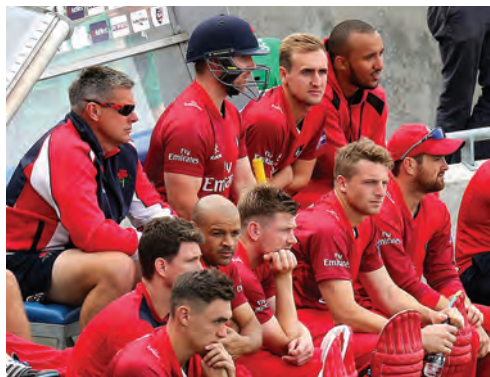
Can we make it