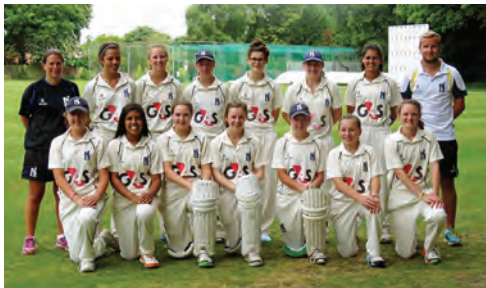
Under 17 Girls Squad

Warwickshire top order contribute 20s and 30s with the bat, and the total of 178-8 was just too much for Leicestershire, and they finished on 150 all out. The girls were now on 5 wins from 5 and had a fighting chance of qualifying for finals day.