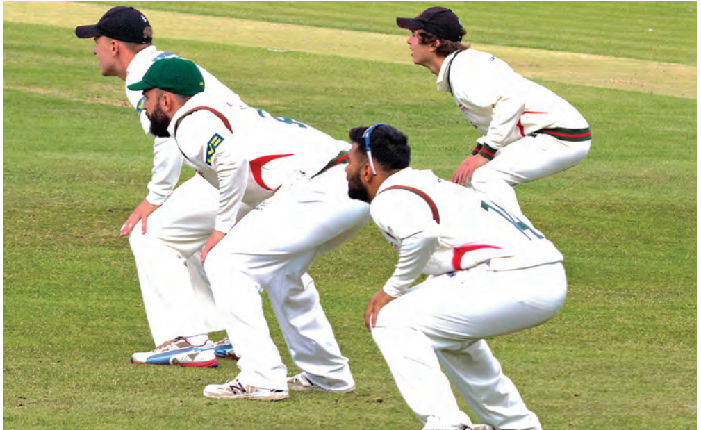
Let the action commence