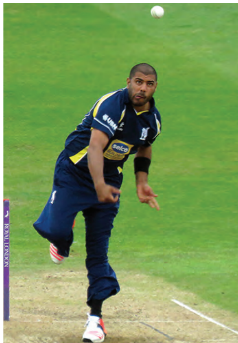
Three wickets for Patel

But Porterfield found a resolute partner in Javid and their measured sixth-wicket stand of 81 in 105 balls kept Warwickshire's hopes of a quarter-final place very much alive.