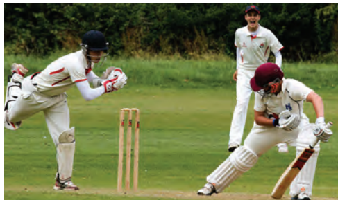
A close call