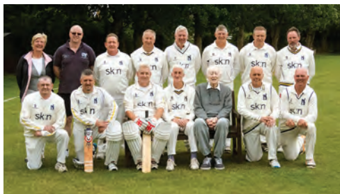
Warwickshire Over 50