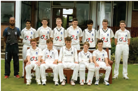
Under 16 Squad