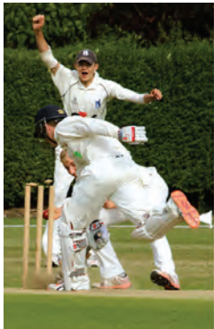
Another wicket falls