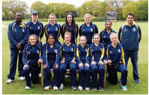
Warwickshire Senior Ladies

Focusing on the season; the first block of games were played against - Nottinghamshire, Yorkshire, Sussex and Surrey form which there were some promising performances