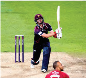
6 runs for Cobb