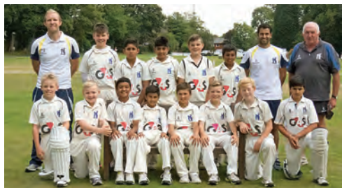
Under 11 Squad