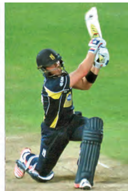
Evans hits out