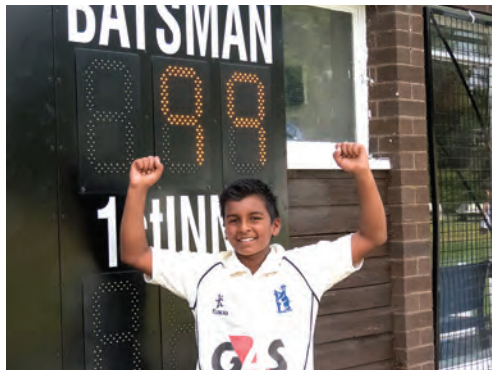
Chaprakari 99 not out, the overs ran out with one run to go