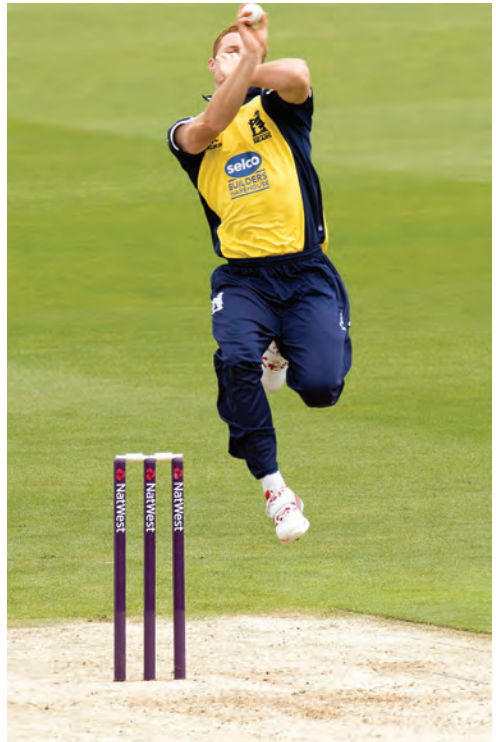
Milnes three early wicket not enough

Josh Poysden 3-125 and Adair 2-57 were the main wicket takers as Surrey were 497-7 at the close and the match drawn.