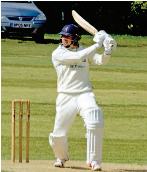
Coleman leads the way with 165

In reply, Jonathan Webb and Tom Lewis put on seventy seven for the first wicket and when Lewis 82 was finally dismissed, a victory looked assured but Warwickshire lost two wickets on 160 including a run out with the final ball, to also close on 160-7 with the match tied.