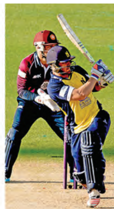
Evans joins in