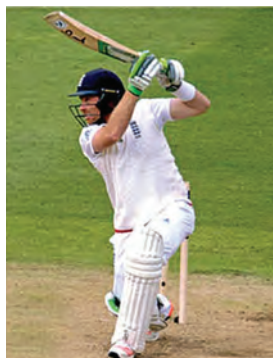
Bell and Root lead England reply