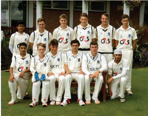
Under 17 Squad