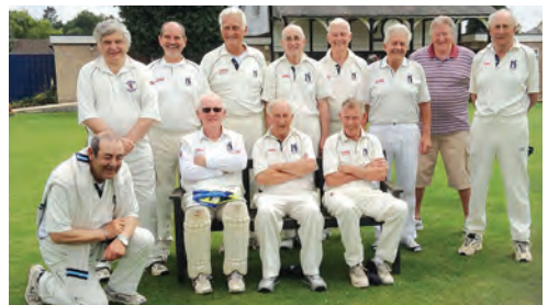
Warwickshire Over 70

As a last thought, we do appreciate how lucky we are at our age to still be playing this glorious game against folks our own age in a pleasant but competitive atmosphere. As we look forward to 2016 please could anyone from age 69 upwards please get in touch.