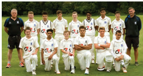
Under 15b Squad

As the wicket dried out, it made it easier for batting and Warwickshire reached their target with 3 overs to spare to bring a winning end to the season.