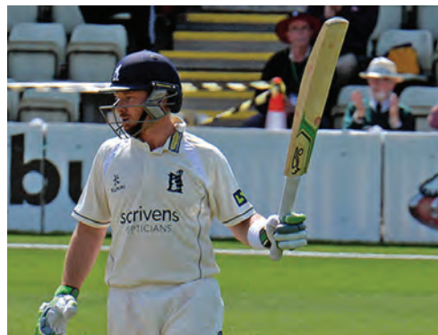
Bell reaches his century

Match Result: Warwickshire won by an innings and 17 runs. Warwickshire 22 points, Worcestershire 4 points.