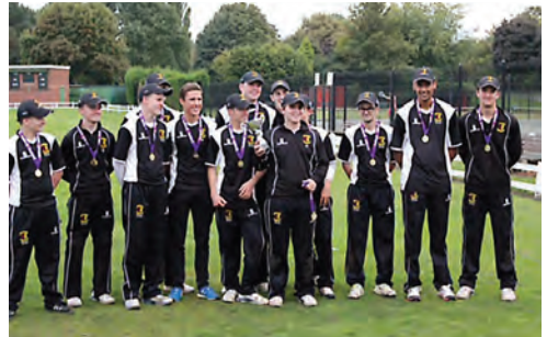
Bedworth Under 19 Squad