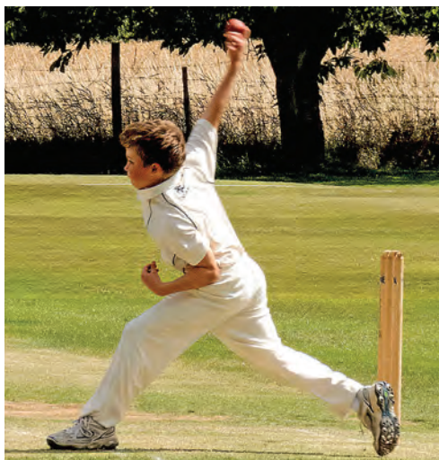
Spin Bowler Plain on the attack