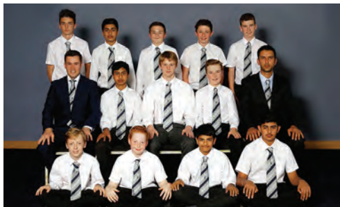
Under 13 Squad

On a well used pitch Yorkshire batted with resolve to post an above par 156. Fahad Sabir bowling well again with ten overs 2-20. Our reply was very poor with no batsman coping with the conditions. A very heavy loss.