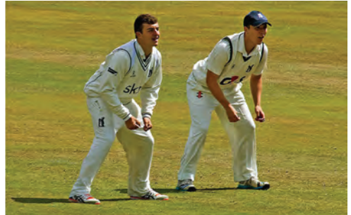
Ready and waiting