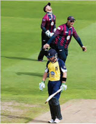
Bell out for 4