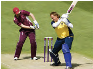
Community Day 2015