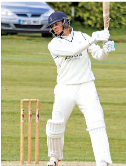
Another century for Coleman

In reply, Umeed and Thomason were dismissed without scoring, while Lambert, Coleman and Webb all fell in single figures as Warwickshire were left reeling on 30-5 in the eighteenth over and as wickets continued to fall, only Banks 16, Milnes 30 and Banton 21 reached double figures before being bowled out for just eighty five, avoiding a possible follow-on by four runs. Fisher 4-23 was Yorkshire's most successful bowler.