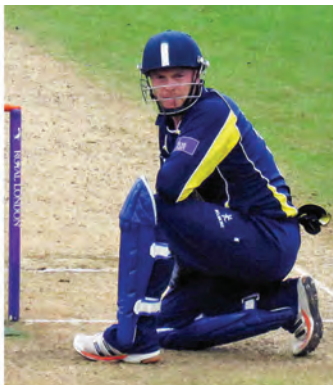
Where has that one gone