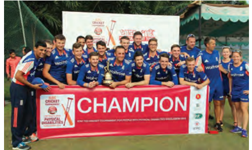
England Physically Disabled Side

In 2015 our programme for cricketers with a disability stepped up a gear as we worked with a variety of partners to increase the scope of our work. Warwickshire Access CC is the playing team which sits behind our work as a Cricket Board with players who have either a physical disability or learning difficulties. In addition to this we have strong links with Warwickshire Visually Impaired CC and run an active Table Cricket programme.