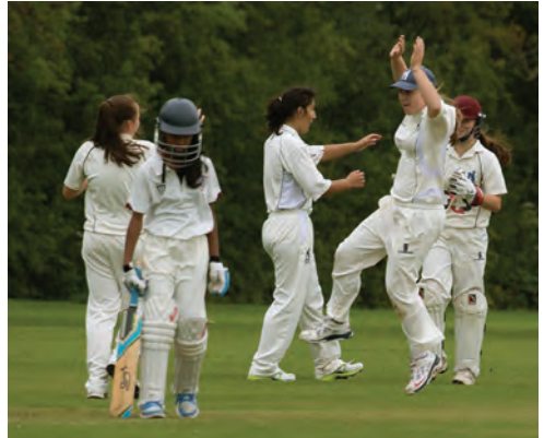
Another wicket falls