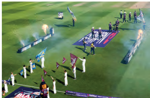
Finals Day gets underway

"We didn't win the game because we didn't deliver the kind of skills we delivered throughout the group stages."