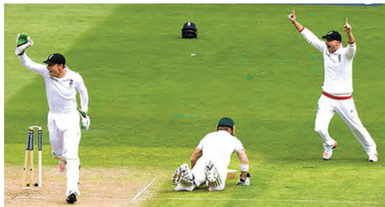
First over Warner just makes it