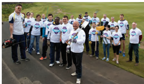
Cricket Force at Portland Road

It is imperative that we thank Persimmon Homes, the England & Wales Cricket Board, Birmingham City Council and Sport England for their sizable contributions and support.