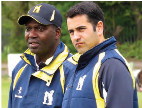
Members of the Management Team

Finally, we must look ahead as the shape of Women's Cricket is forever developing, with the introduction of the Women Cricket Super League to be launched in August 2016. Warwickshire women must now stay with the pace as coaching staff are making the necessary plans and adjustments to cope with the change.