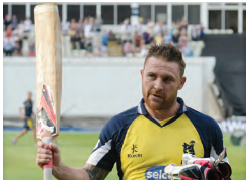
Brendon McCullum leaves the field after his innings of 158 not out

In the NatWest T20 Blast we were reigning champions and performed accordingly in the group stages when we were comfortably the best side in the competition. Brendon McCullum's 158* against Derbyshire Falcons will