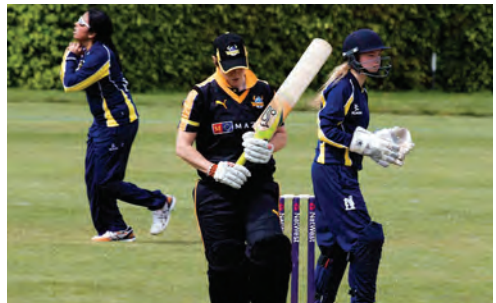
A great slip catch