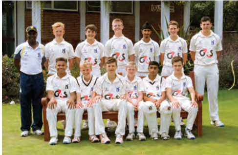
Under 15 Squad