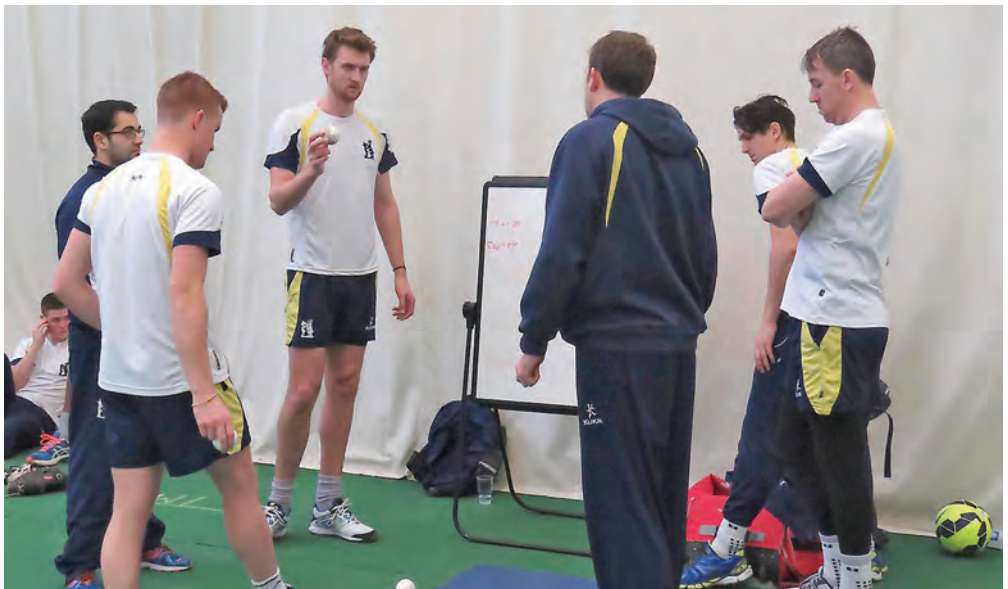
Getting ready for 2016

In closing I would like to thank all the customers who have used the Edgbaston Cricket Centre throughout the last 12 months, we thank you for your support and at times patience and we will endeavour to provide the same and better level of service.