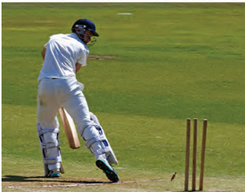
Wicket for Brookes