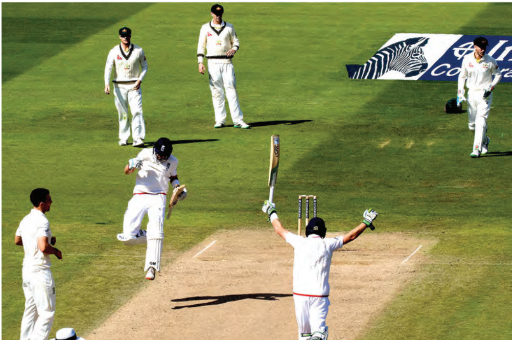
Game over England win by 8 wickets