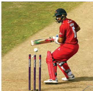
Prince bowled Edwards for 14