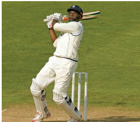
Barker's 71 runs most in both innings

Enforcing the follow-on Nottinghamshire were left frustrated