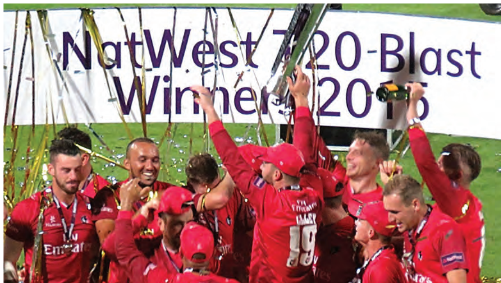
Let the celebrations begin

So, Lancashire Lightning won their first t20 title with a 13-run winning margin.