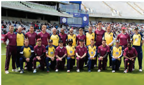
Community Day Teams

Following the success of the inaugural event in May 2014 the County Club once again decided to hold a Community Open Day at Edgbaston, with many activities taking place around the stadium and concluding with a t20 cricket match between a Warwickshire Legends XI and a Combined Services XI to highlight the work of Fisher House