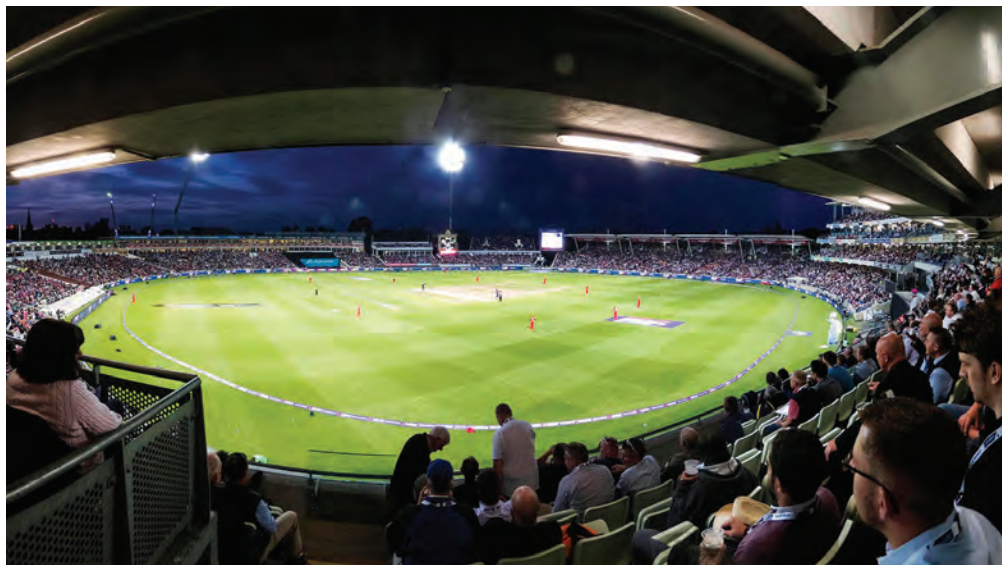
Another full house on 20-20 Finals day