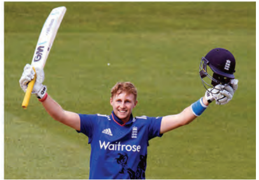
Another 100 for Root