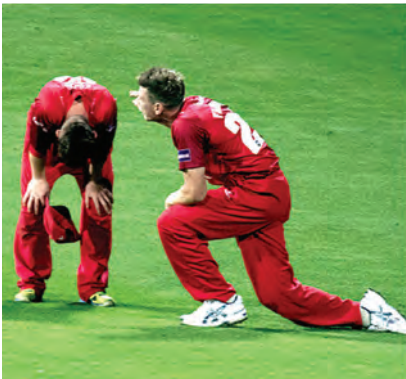
Drama as catch is dropped