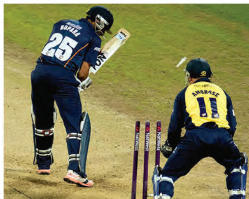
Crucial wicket Bopara goes for 32