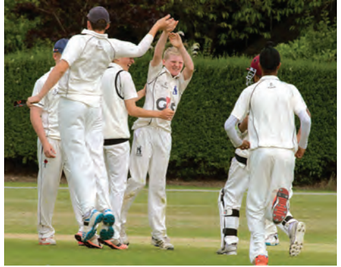
Not out this time