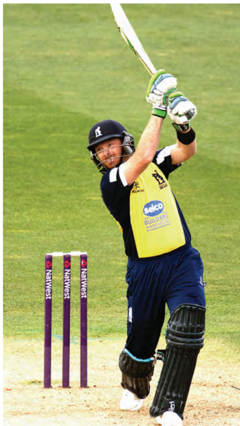
Bell just ten runs short of his century

Stokes hit a straight six, but the Bears' gamble in leaving Javid on paid dividends when he had Stokes lbw for 40 attempting a reverse sweep.