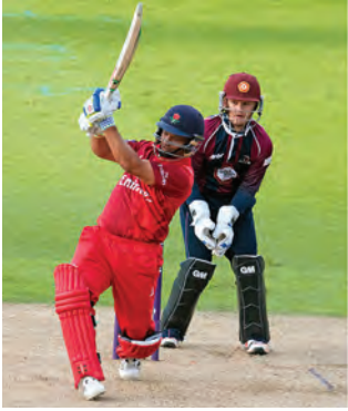
Prince and Davies take control