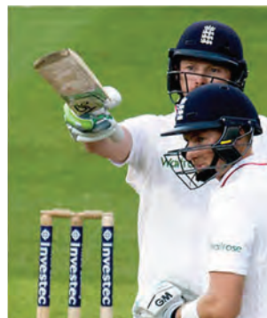
50 for Bell