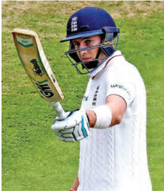
50 for Root