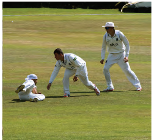
Nearly but not quite