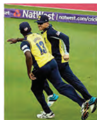
Maxwell out for 6