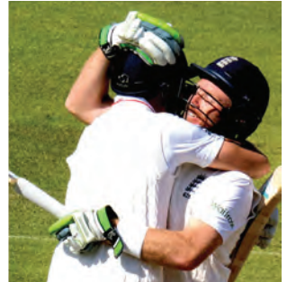
Root and Bell celebrate victory