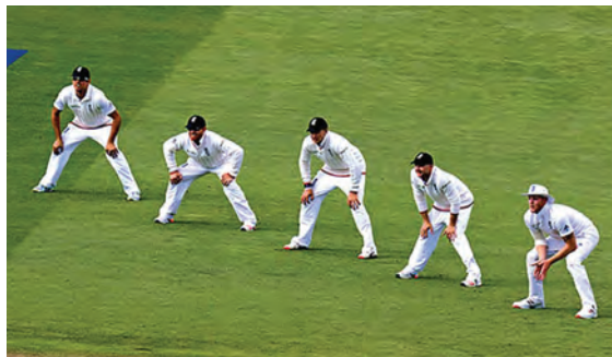
England on the attack