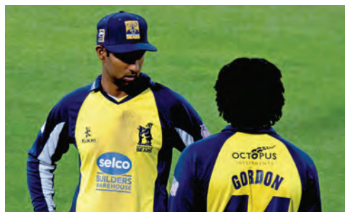
One over left - can we do it?