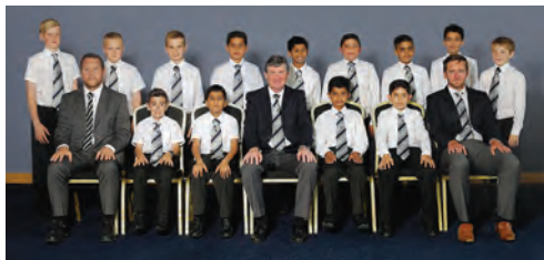
Under 10 Squad

In our last match we were brought down to earth by a strong Staffordshire team where, whilst we batted well, the bowlers made little headway taking only two wickets against some very good batting. Staffordshire ran out worthy