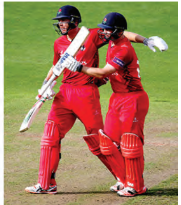
We have made it through to the Final