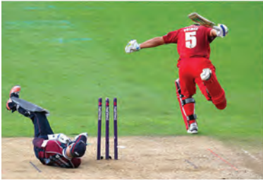
Prince just gets home