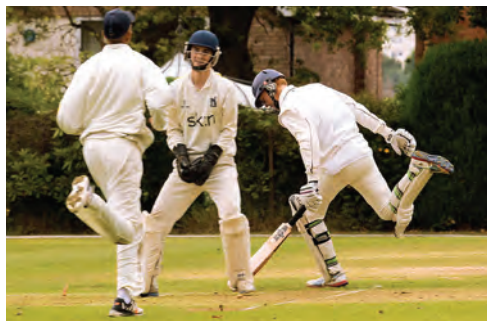
Another wicket to celebrate