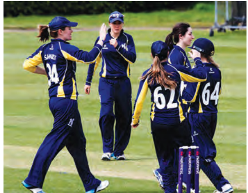
Another wicket falls