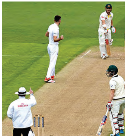
Warner lbw Anderson 2