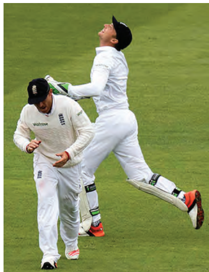
Marsh departs for 0