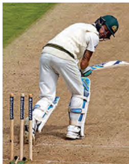
Clarke bowled Finn 10