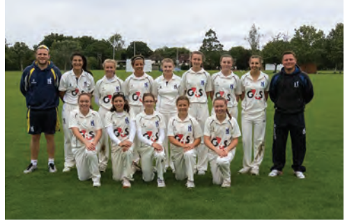
Under 15 Girls

our nerve and gained a very close win. In the second series of t20 games we failed to get in together losing both games (the second to Oxfordshire). However we got some pleasure and revenge 2 days later in beating Oxfordshire in the league game by a large margin. With our big wins this now meant we had edged Oxfordshire out of top spot and were beginning to look like potential league winners, until