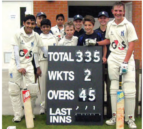
A record score by any Under 13b Squad