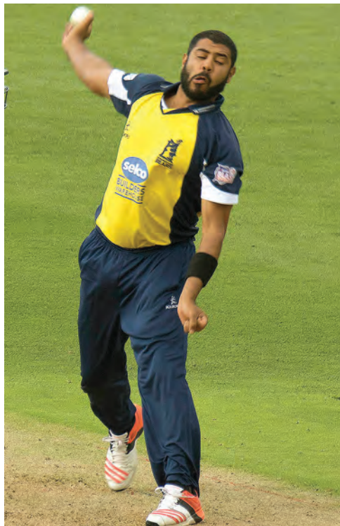
Evans top run scorer and Patel top wicket taker in 2015

Consolidated figures for the First-Class and competitive Limited Overs matches in 2015