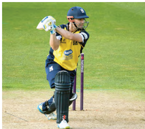
Porterfield top score with 55

A superb running catch from Keogh on the deep cover removed Evans and the boundaries dried up completely after Clarke fell for 27 in the 18th over.