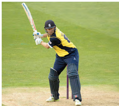
Clarke joins in run chase