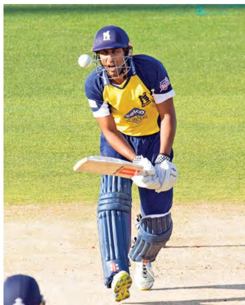
Evans and Chopra the only ray of sunshine

A score of 141 for 7 felt inadequate, and so it proved to be.