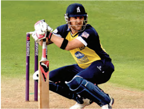
McCullum scores first 20-20 century

Obviously, the highlight of the season has to be McCullum's 158 v Derbyshire. In addition to it being our first hundred in the history of the competition, it was an innings