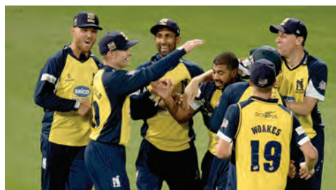
Bring on Finals day